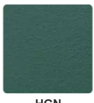
HGN HUNTER GREEN TEXTURED