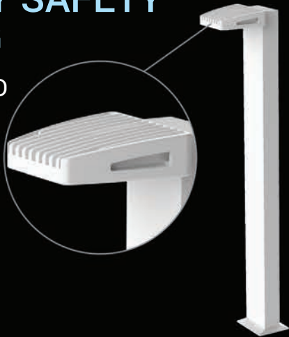
NV-BOLLARD 20W - 45W