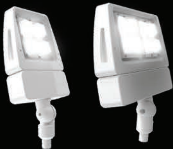
NVF-2 50W - 80W