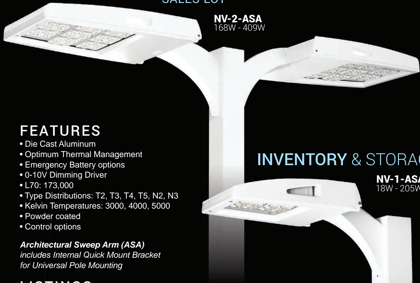
NV-2-ASA 168W - 409W