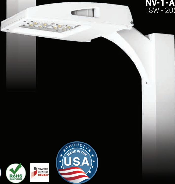
NV-1-ASA 18W - 205W