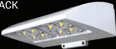
NV-WALL PACK 19W - 100W