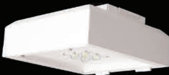
VSS-S-CM 18W - 106W