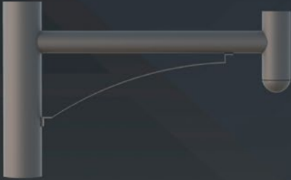
A 9 Single