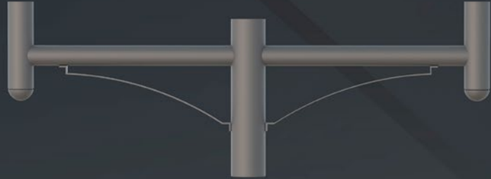
A 9 Double 180°

Architectural Arm 9 is constructed of extruded aluminum tubing and available for both post top and pendant mount luminaires. Integrates with poles or tenons of 3-1/2", 4", 4-1/2", or 5" OD and is secured with 3/8" stainless steel Allen set screws.