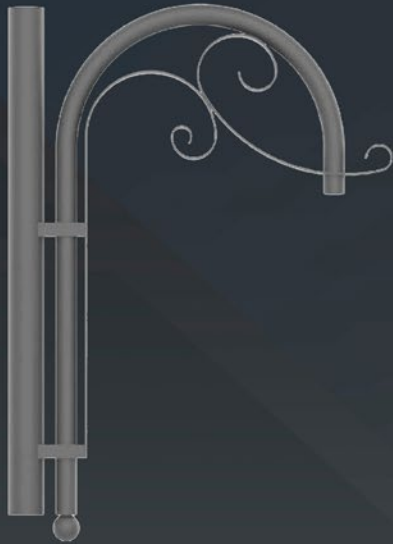
A 17 Single