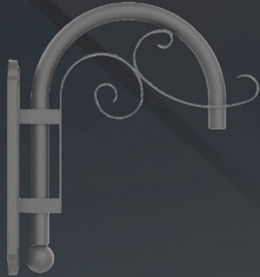
A 17 Wall Mount Cast Wall Plate

Architectural Arm 17 is constructed of extruded aluminum tubing. Integrates with poles or tenons of 3-1/2", 4", 4-1/2", or 5" OD and is secured with 3/8" stainless steel Allen set screws.